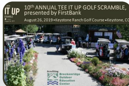
Check out last year's Sponsorship Recap